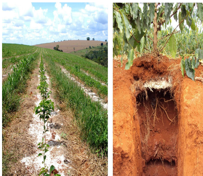
FIGURE 1 - Partial view of the experimental area (left) and detail of the sampling trench showing the gypsum-buried layer of the 56 t ha -1 treatment (right).

The soil solution chemical speciation was done using the Visual Minteq program (Gustaffson, 2018), based on the total concentrations (mg L -1 ) of all the cations, anions, DOC, and pH obtained as described above, for each treatment and soil depth sampled in the field. The results of soil chemical tests were submitted to analysis of variance. The experimental design was a randomized block design with three replications. The clustering of the means was done by the Scott-Knott test, adopting the p values 0.05 as criterion of significance of the difference between the means. The data were processed using the software SISVAR 5.6, Build 86 (Ferreira, 2014).