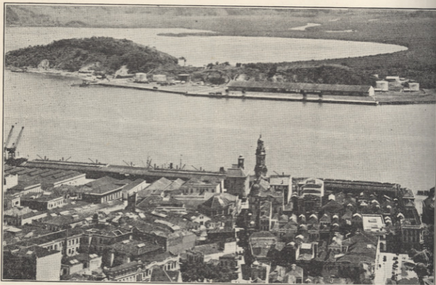
SANTOS, THE LARGEST COFFEE-EXPORTING PORT IN THE WORLD This partial view shows the coffee loading docks and the Coffee Exchange