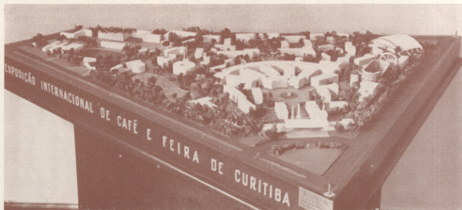
Above is a table model of the buildings which will house the Parana Centennial Celebration. One-story buildings are constructed of wood and aluminum. The eleven pavilions of the International Coffee Exposition and buildings where World Coffee Congress will meet are in right foreground adjacent to the entrance to the grounds.

The first four sessions of the Congress, on December 11, 12, 13 and 14, will be mostly of a preparatory