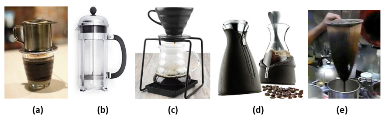
Figure 1: Coffee Manual Brewing Devices. (a) Vietnam Drip; (b) French Press; (c) V60; (d) Eva Solo; (e) Fabric Filter.