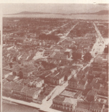
The port of Paranaguá has become one of the world's leading coffee ports in recent years. The pictures above show the harbor with its warehouses for handling coffee, coffee being loaded aboard a steamer, and a general view of the city and harbor. Paranaguá is located on a lagoon-like harbor, one of America's best.